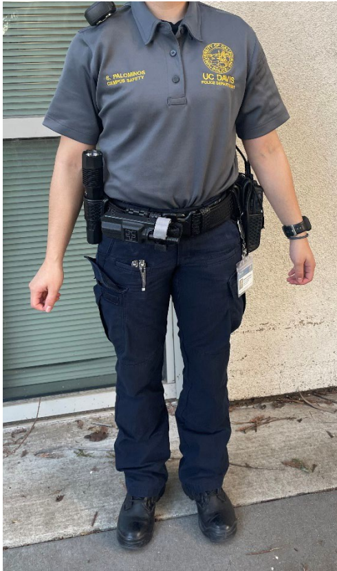
Front of Uniform