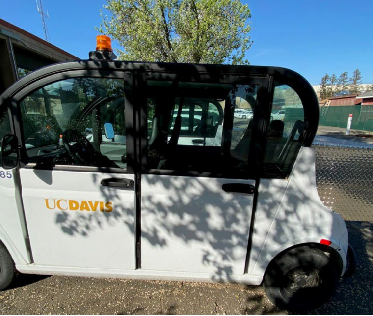
Above: GEM Vehicle