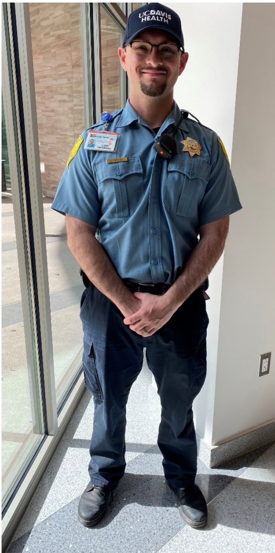
Front of Uniform