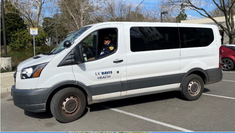
Left: Protective Service Officers (PSO) Vehicle Below: Campus Safety Specialists (CSS) Vehicle