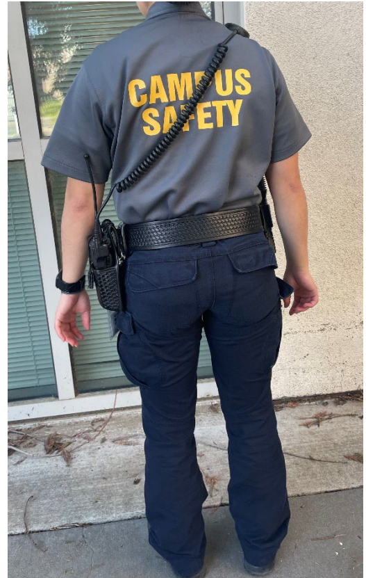
Back of Uniform