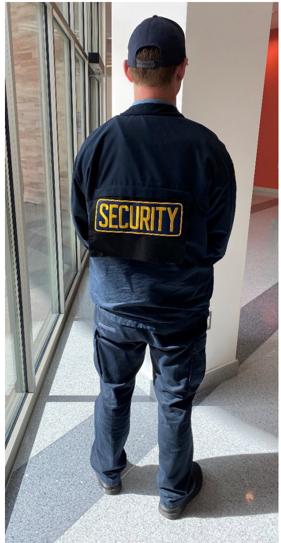
Back of Uniform