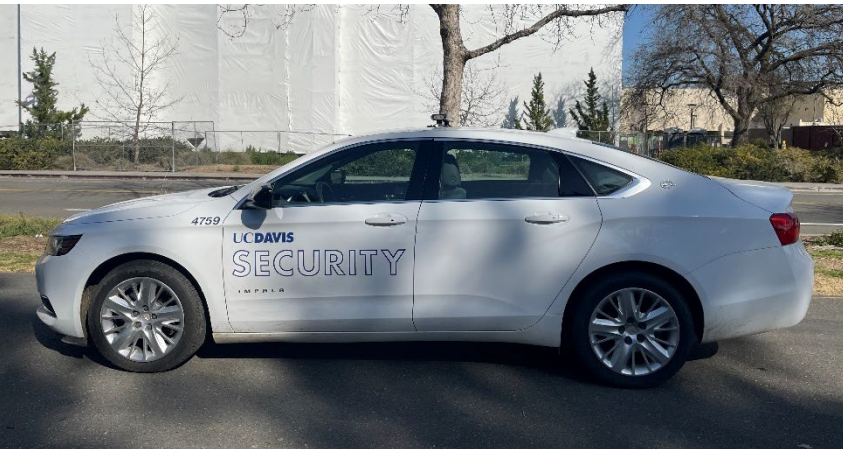
Left: Protective Service Specialist (PSS) Vehicle