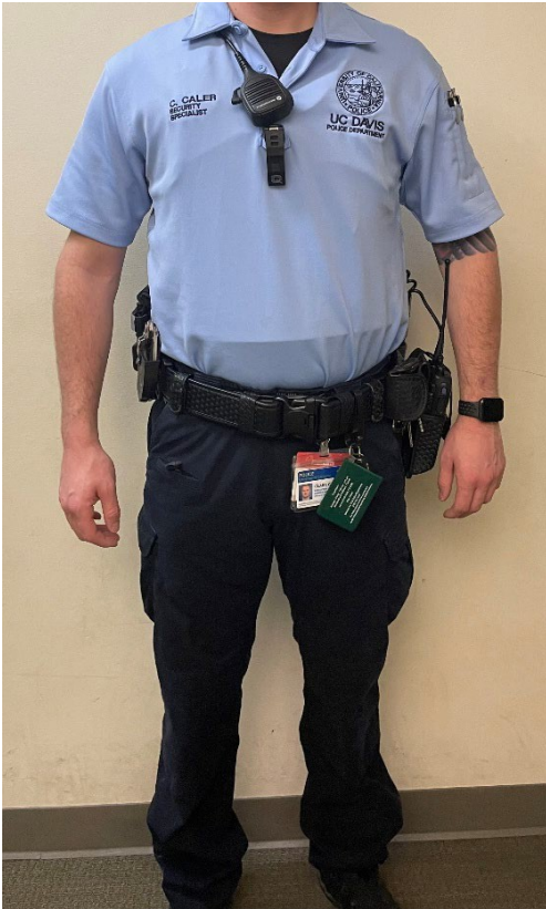
Front of Uniform