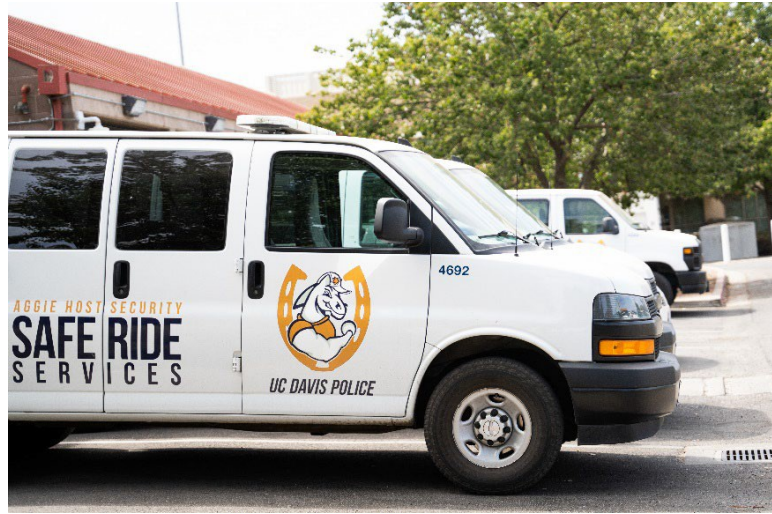
Above: Aggie Host Vehicle