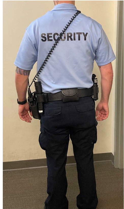
Back of Uniform