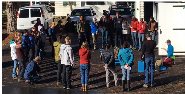
WFA training at UC Merced's Yosemite Field Station

First Responder (WFR) courses are both taught at numerous UC campuses. Other training providers within California include Sierra Rescue and Wilderness Medicine Associates . For trip leaders, field scientists, or students that plan to pursue a career doing outdoor work, WFR training is highly-regarded professionally and will prepare individuals to manage a broad-range of emergency situations, illnesses, and injuries.