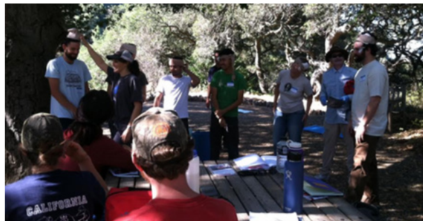
WFA training at UC Botanical Garden