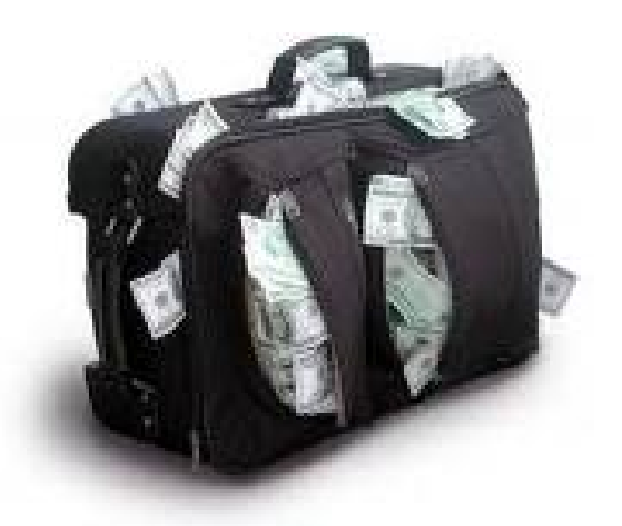
Cash advances to employees