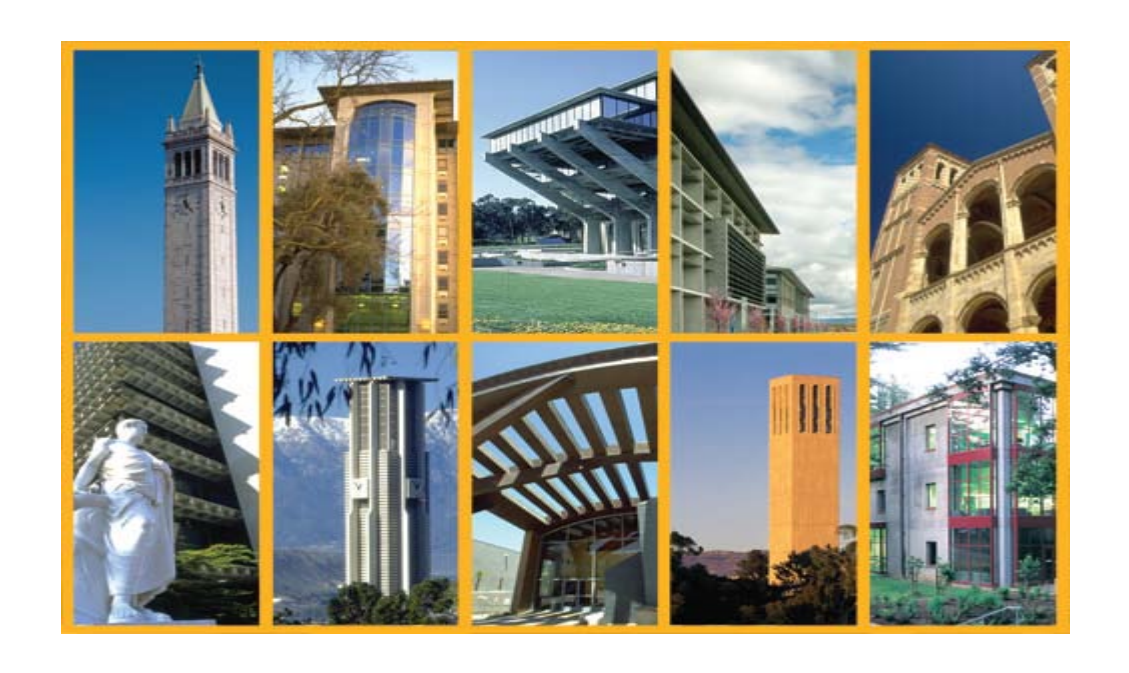
Internal Audit Plan 2012-13