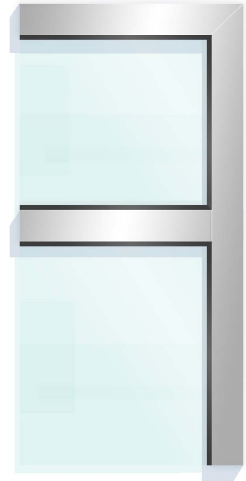
Windows and Frames