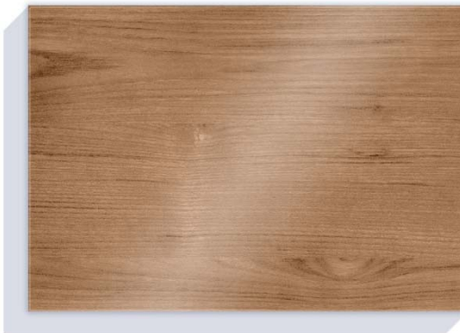
Wood Beams and Soffit