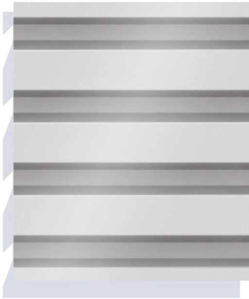
Metal Panel Siding