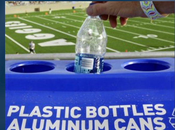
UC Davis's zero-waste Aggie Stadium