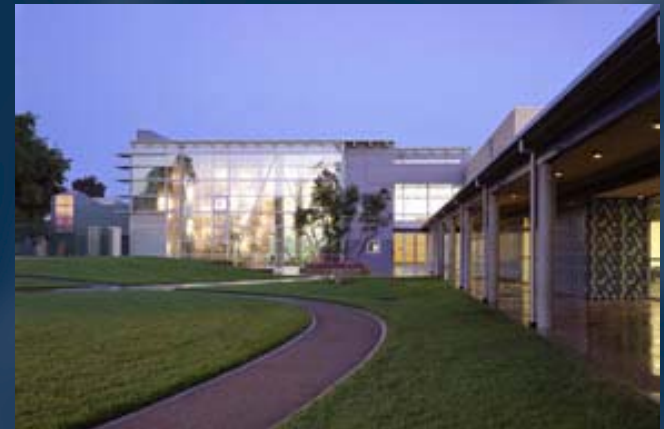
UCSB Recreation Center, LEED-EB Silver (2008)