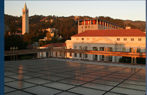
UC Berkeley's 100 kW PV array, located on Martin Luther King Student Center roof