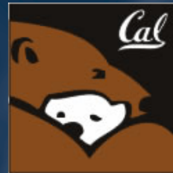
Logo of the Cal Climate Action Partnership