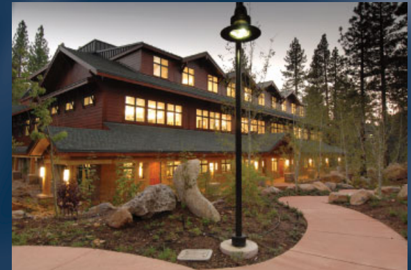
Tahoe Research Center, UCD – LEED Platinum