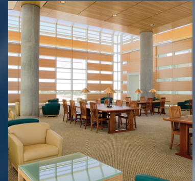
Kolligian Library, UCM – LEED Gold