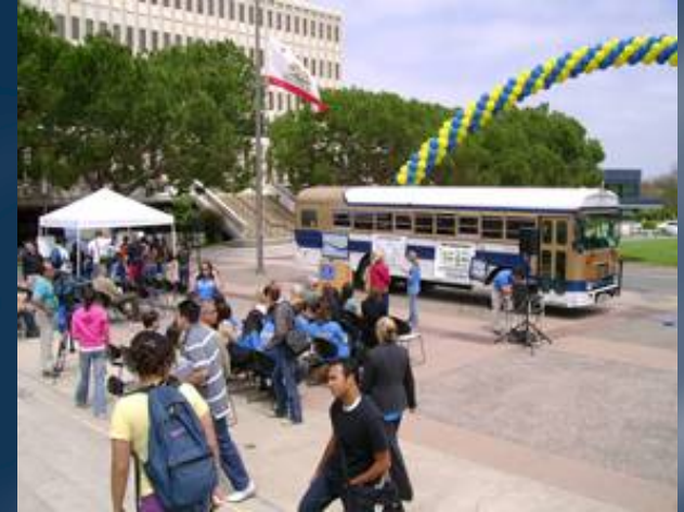
The debut of UC Irvine's first shuttle to run exclusively on biodiesel