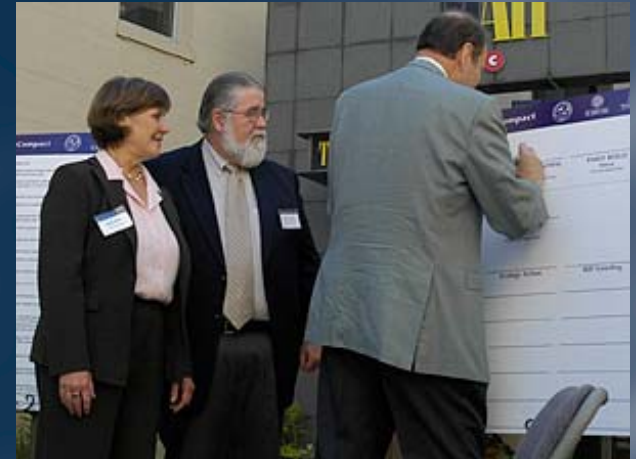
UCSC Chancellor Blumenthal signs the Climate Action Compact as Santa Cruz's Mayor and County Supervisor Look On.