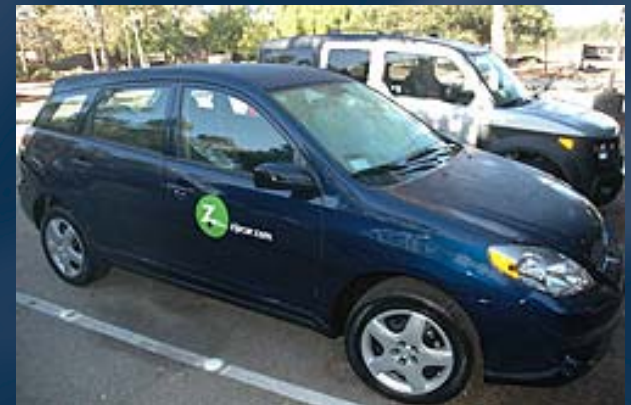
Zipcar car share program at UC Santa Cruz