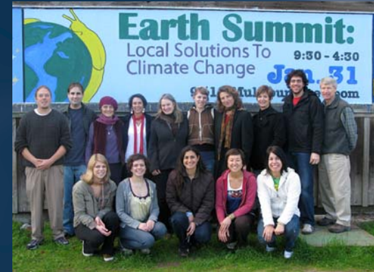
UCSC Student and staff organizers of the 8 th annual campus Earth Summit