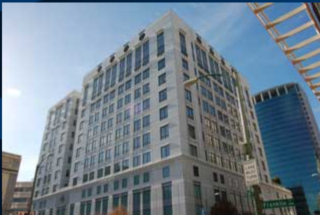
UCOP Franklin Building, LEED-EB Silver (2007)