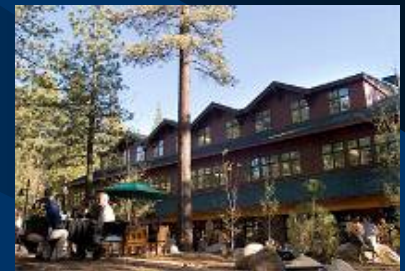
Tahoe Center, UCD – LEED Platinum