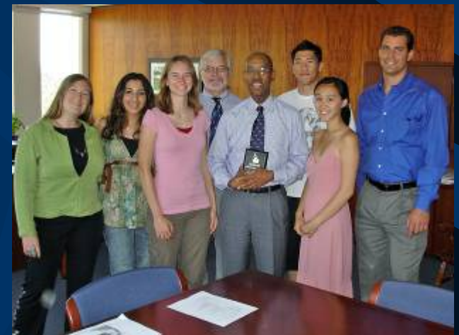
UC Irvine Chancellor Drake meeting with representatives of environmental student groups