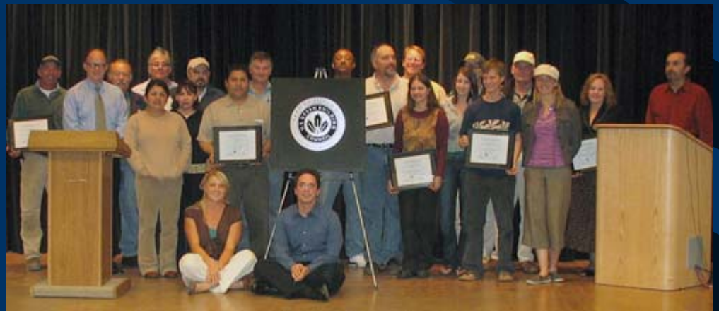
UCSB's Girvetz Hall Project team receiving LEED-EB Silver plaque (2005)