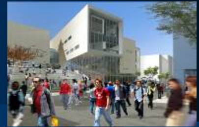
Price Center, UCSD – UC Silver