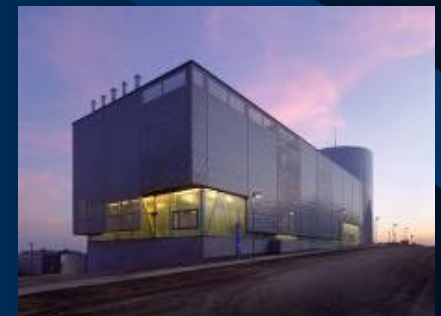
Central Plant, UCM – LEED Gold