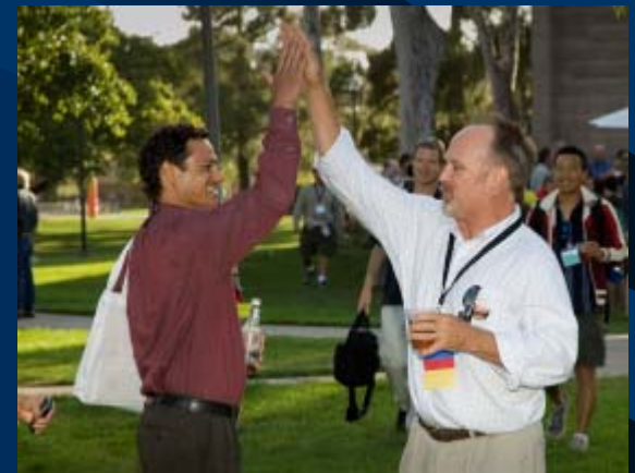
Award winners and attendees at the 6 th Annual UC/CSU/CCC Sustainability Conference, UC Santa Barbara June 2007