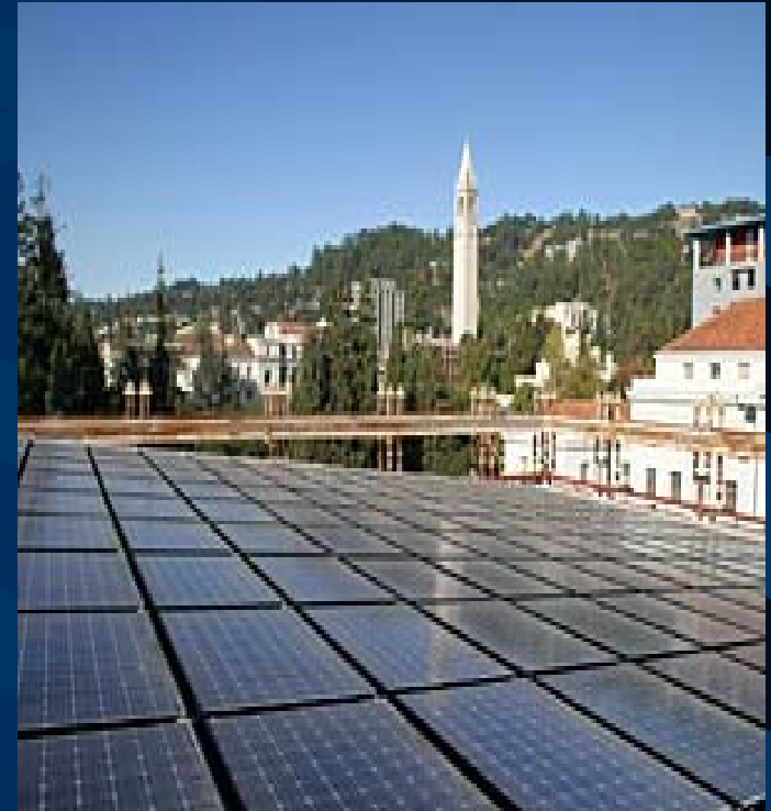
UC Berkeley's 120 kW PV array, located on Martin Luther King Student Center roof