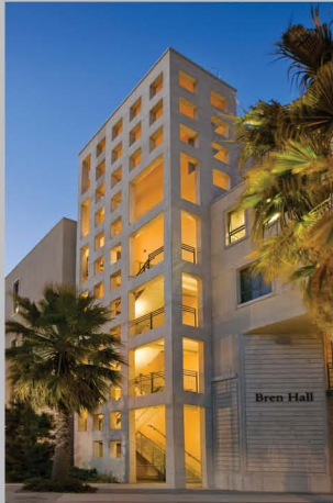
UC Santa Barbara: Bren Hall

CAPITAL RESOURCE MANAGEMENT • BUDGET &amp; CAPITAL RESOURCES • UC OFFICE OF THE PRESIDENT