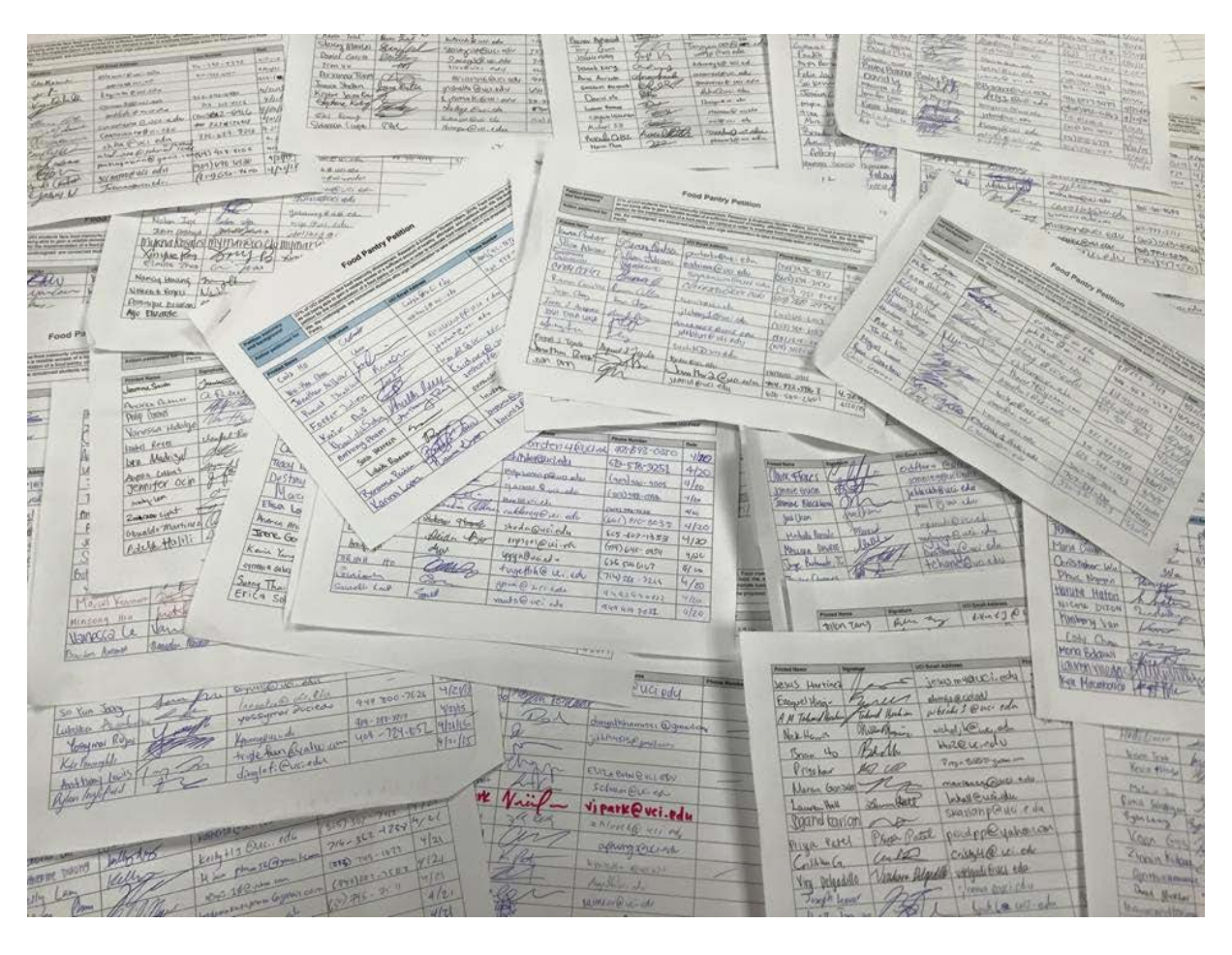
A total of 1,025 individuals signed to support the establishment of a food pantry at UC Irvine and urge the administration to provide additional resources to solve food insecurity issues.