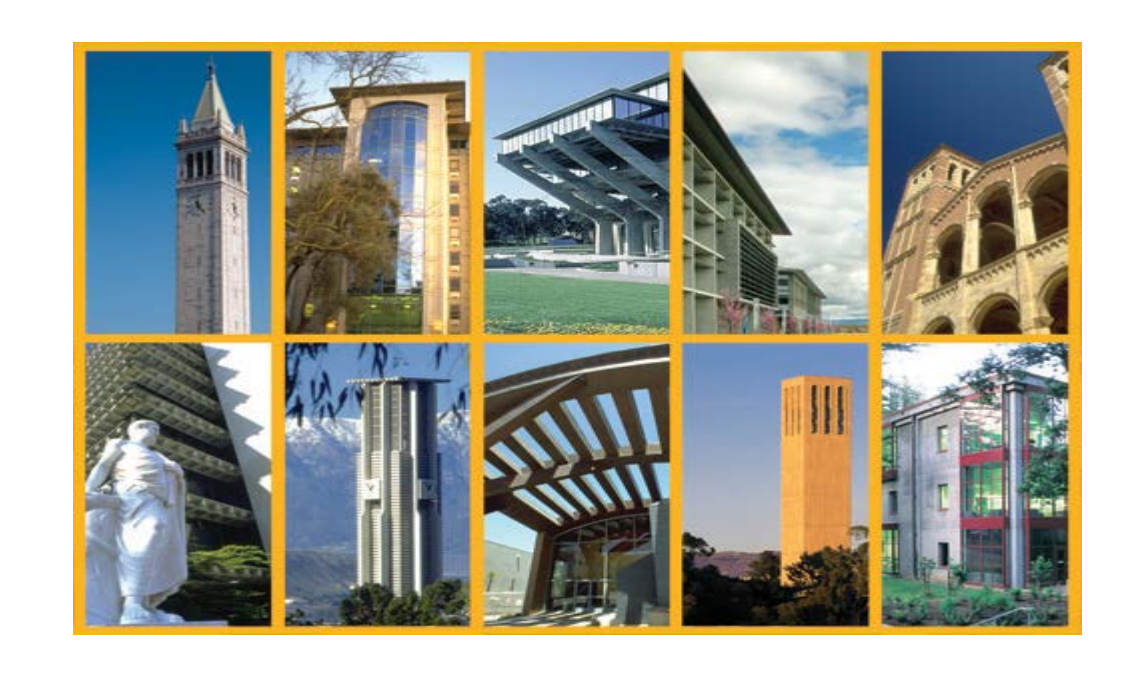
Internal Audit Plan 2013-14